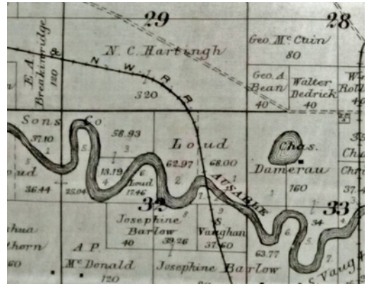
1903 Iosco County Plat Book Clarks March Area

the Consumers Power Company in the 1956 and 1979 Plat Books, as part of the Au Sable State Forest in the 1985 book and finally the USA (Forest Service?) in the 1991 losco County Land and Plat Book.