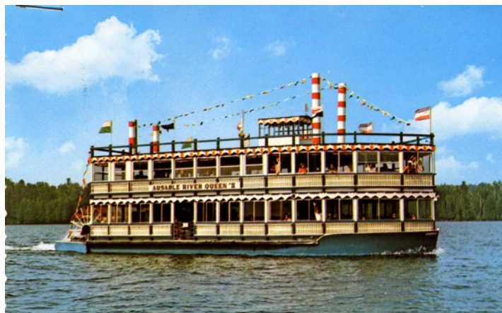
River Queen II

By 1966, when potential competition became a reality, River Queen II was designed and then constructed on the shore of Foote Pond