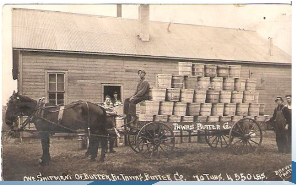
Huron Shores Genealogical Society