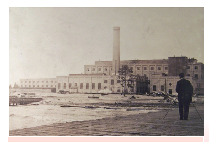
In 1903, the Tawas Sugar Company constructed this processing plant at East Tawas, southwest of today's Tawas Beach R. Road "Y" intersection with Huron Shore Road. The plant closed in 1905 because of a lack of beets to process.

the company wasn't as favored by our US Armed able to take the place of the timber industry that had Forces, as they were turned down in 1901 with the sustained the area for so many years.